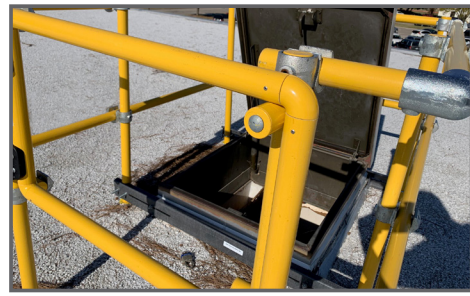
Self-closing gate prevents accidental entry.