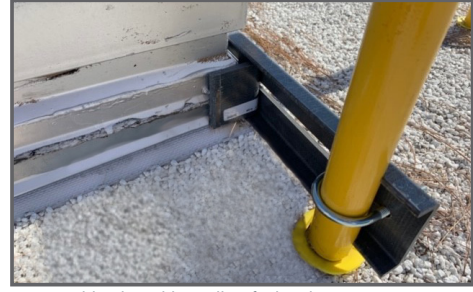
Width adjustable to allow for hatch size variations.