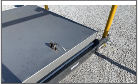
Unique compression fit design. No drilling!