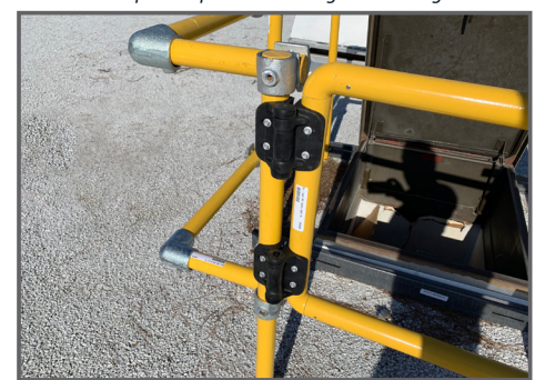
Rugged hinges allow gate tension adjustment.