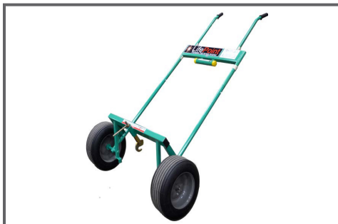
Optional Transport Cart