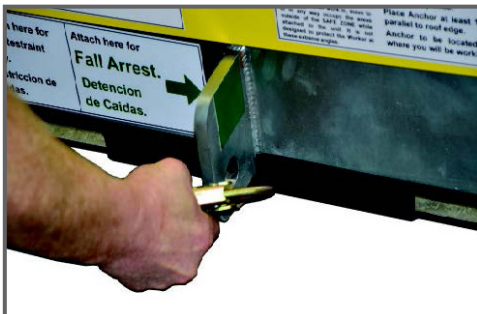
Your lanyard can connect to either the fall-restraint or the fall-arrest.