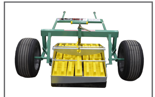
To move cart, position cart, raise DynaWeight, and move to new location.